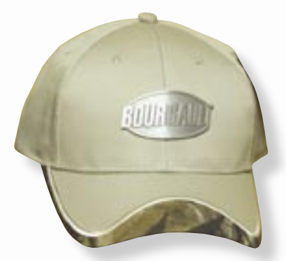
SAND-COLORED A "MOSSY OAK" CAP

Sizes One Size Product # W121 Price $16.25