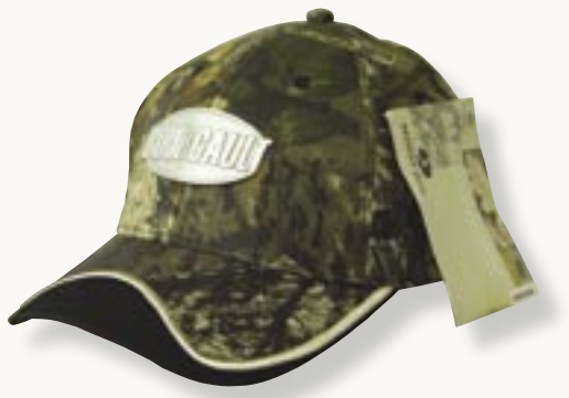
CAMOUFLAGE ▲ "MOSSY OAK" CAP

Sizes One Size Product # W122 Price $16.25