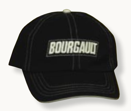
▲ SUPER SOFT BLACK TWILL CAP WITH CREAM STITCHING

Sizes One Size Product # W121 Price $16.25